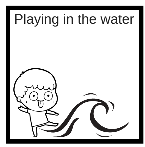
Circle any activities you think might hurt the tidepools.